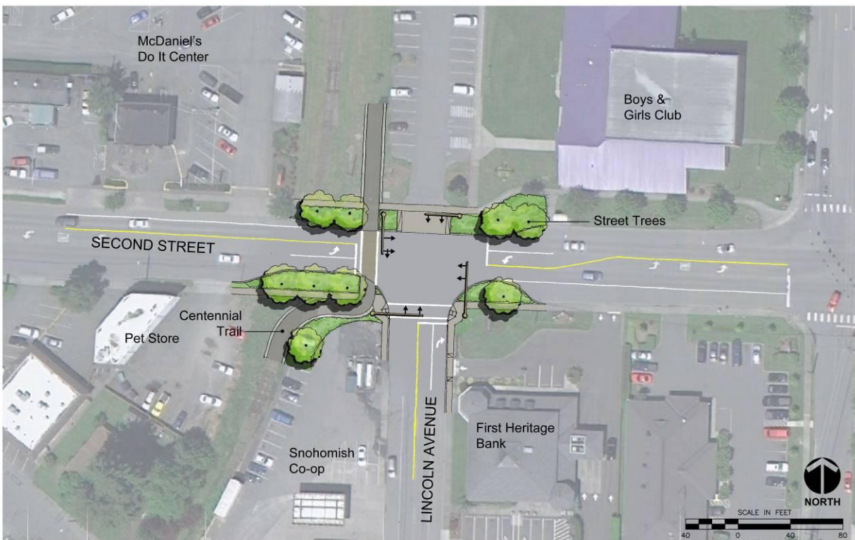
Second Street and Lincoln Avenue Traffic Signal Project